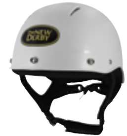
THE NEW DERBY® – WHITE