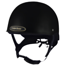
THE NEW DERBY® – JOCKEY